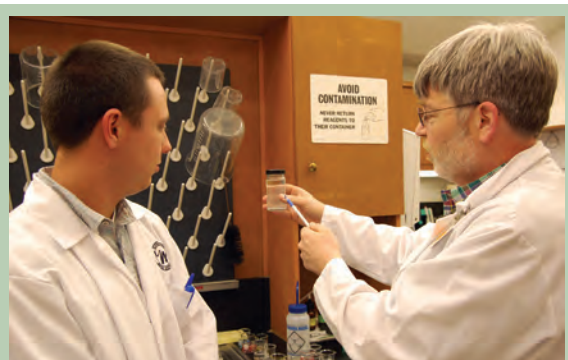
Laboratory staff continually monitor Marina's drinking water. Water quality data is posted monthly on the MCWD website ( www.mcwd.org ).