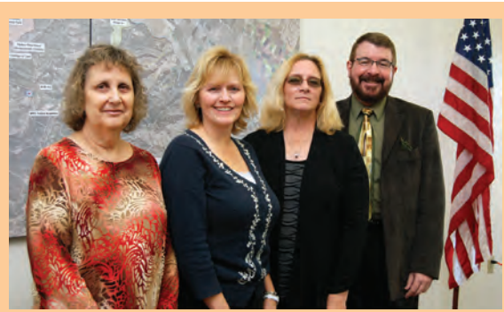
The District's Customer Service staff is available to assist you Monday through Friday, 8 AM to 5:30 PM.